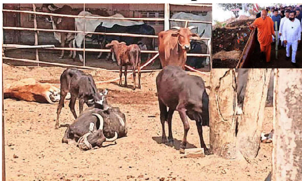
Over 50 cows died at the Kaneri Mutt in Kolhapur due to food poisoning. (Inset: Maharashtra CM Eknath Shinde during inauguration of the festival).

To convince the importance of environment and the importance of animals, an exhibition has been organised and various food stalls have been set up. It is said that the food prepared in bulk, anti-participation of a large